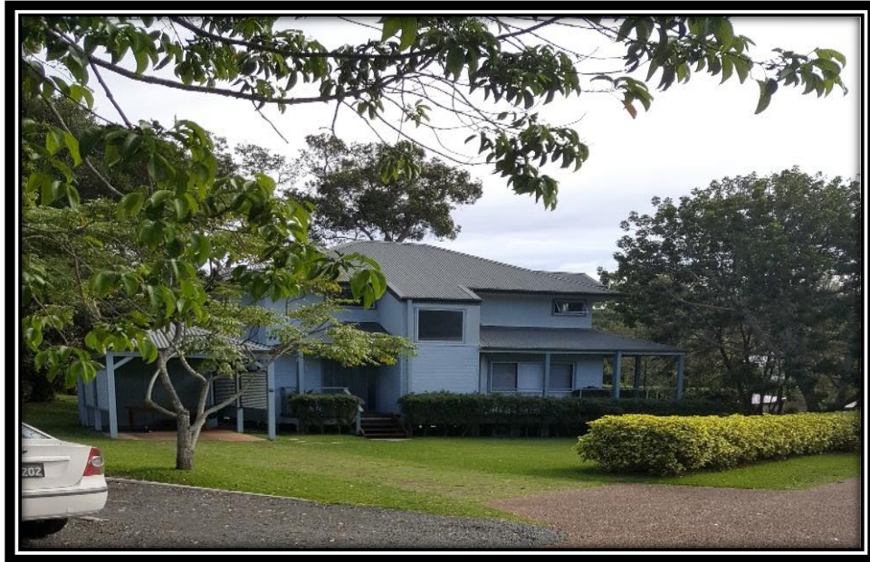
Figure 7 Blueys Retreat Accommodation Venue