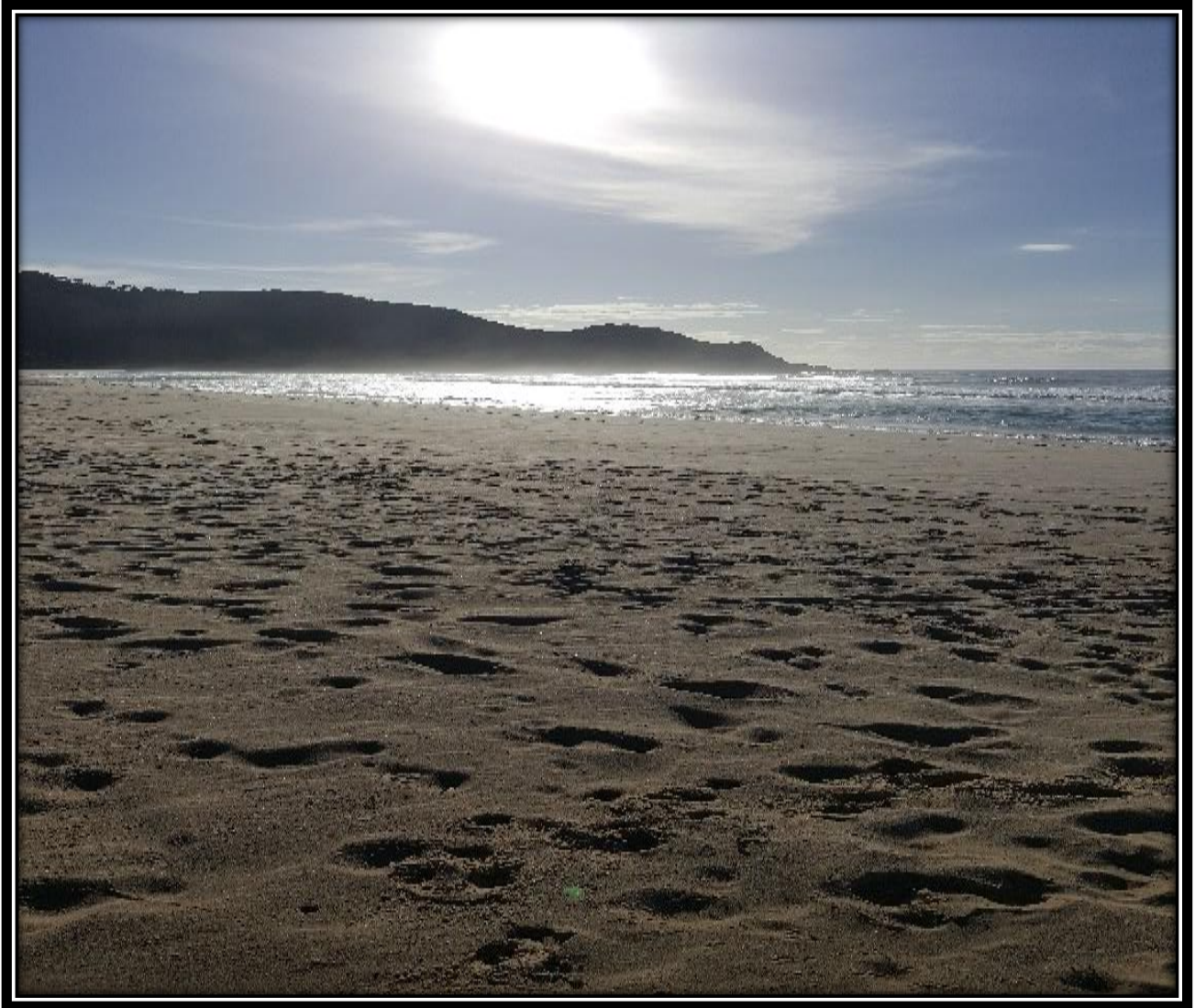
Figure 4 Boomerang Beach