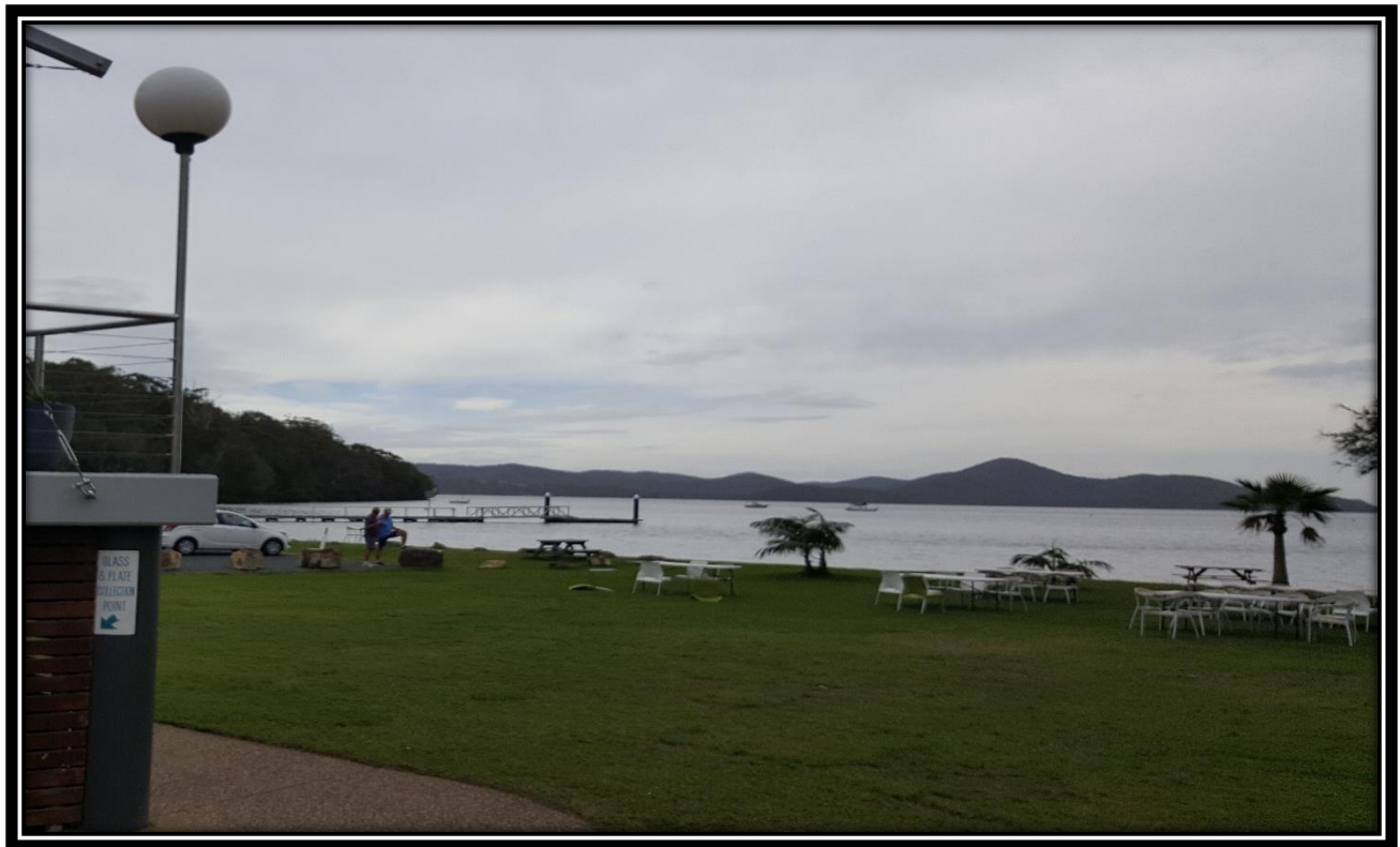
Figure 3 Lake Wallis from Recreation Club