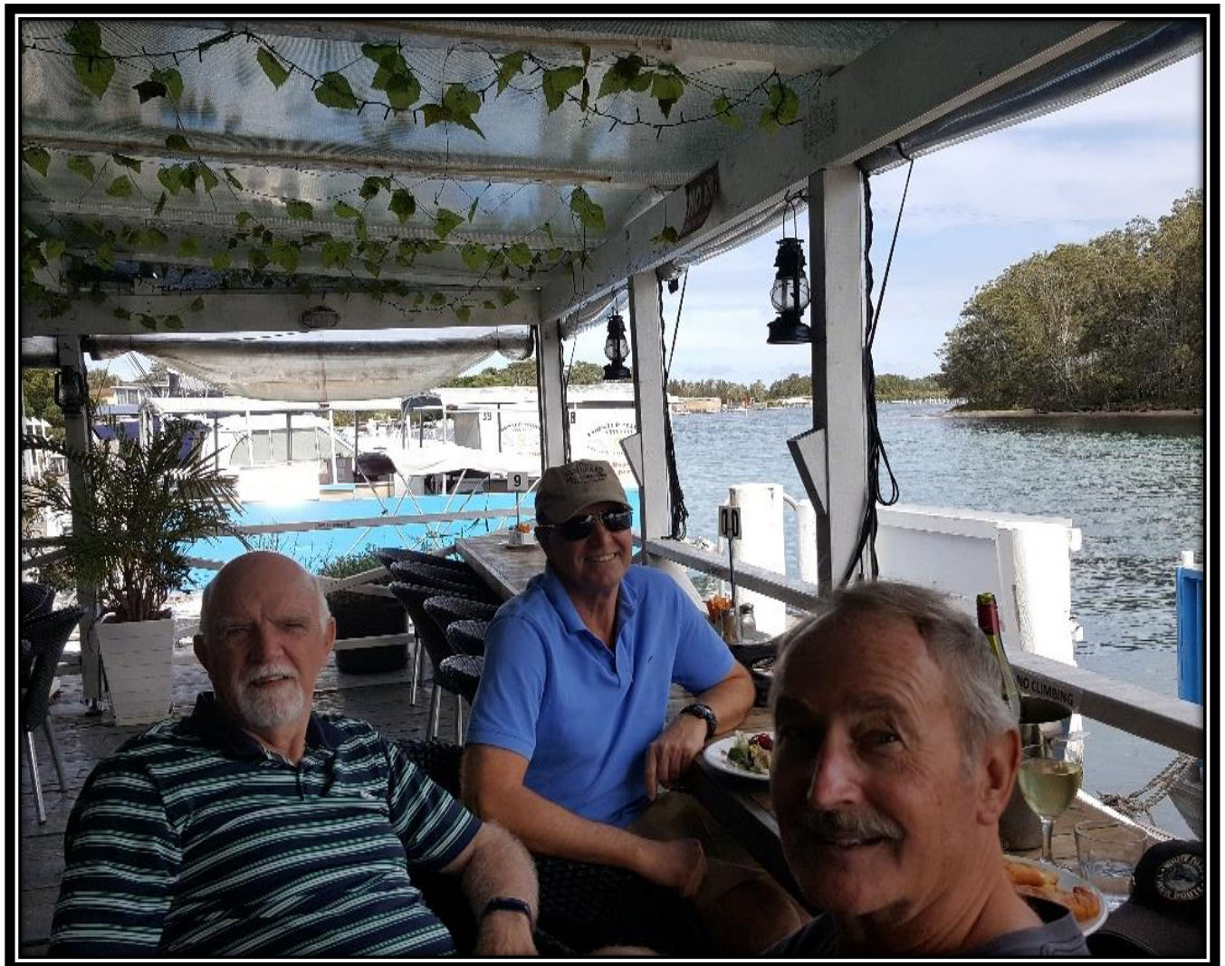
Figure 7 The Organising Group hard at work on your behalf at Isola, Little St Forster