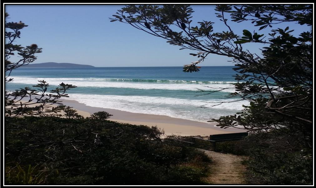
Figure 1 Seven Mile Beach