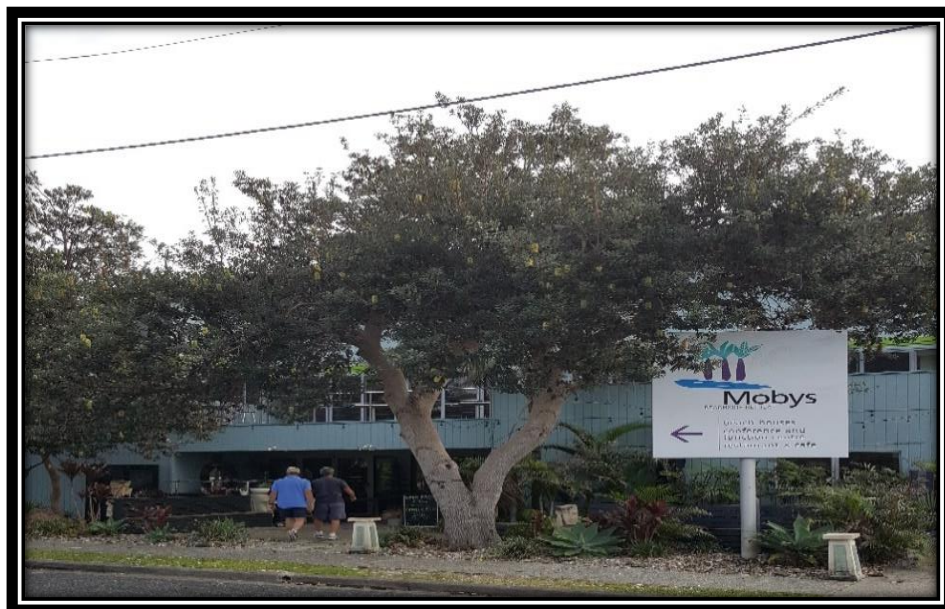
Figure 6 Moby's Formal Dinner and Accommodation Venue

Note: In Bill's opinion the accommodation at Blueys Retreat is nicer. However, the downside is that it is 1.2 km from the dinner venue (Mobys)