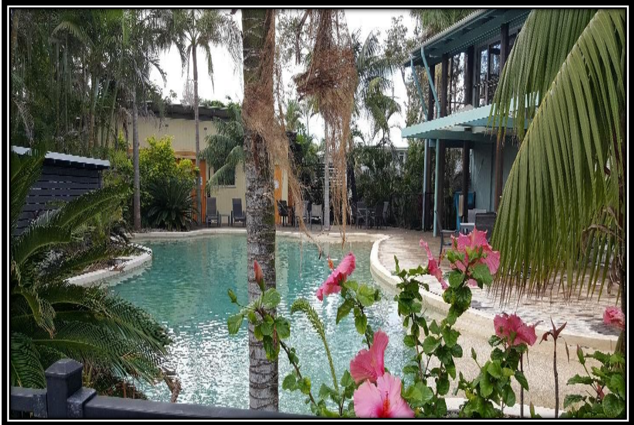
Figure 8 Moby's Pool

Come and spend a couple of days in a beautiful area, enjoy some time on the beach or by the pool; but most importantly enjoy the camaraderie of mates and the friendships that have lasted 46 years. The greater the turnout the better the celebration and the more enjoyment for all.