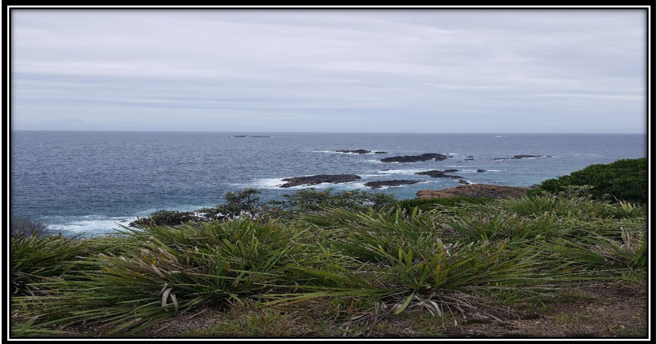
Figure 9 Seal Rocks