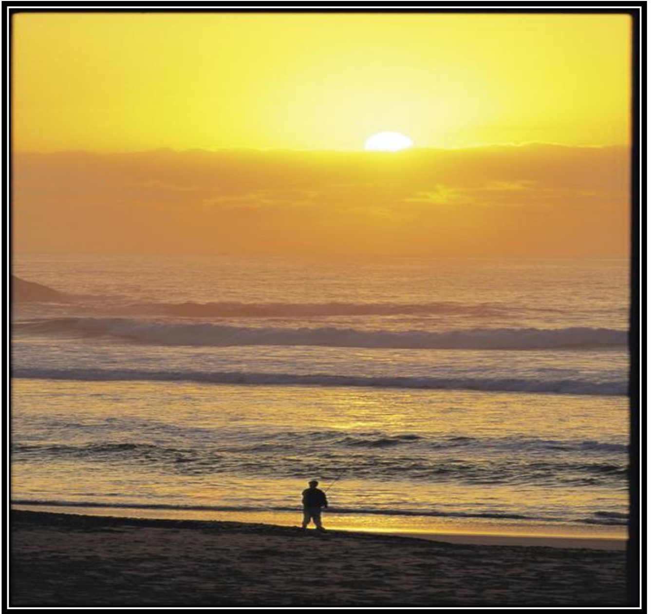
Figure 6 Fishing Boomerang Beach