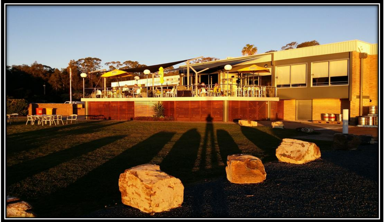
Figure 2 Pacific Palms Recreation Club at Sunset - Welcoming Drinks Venue