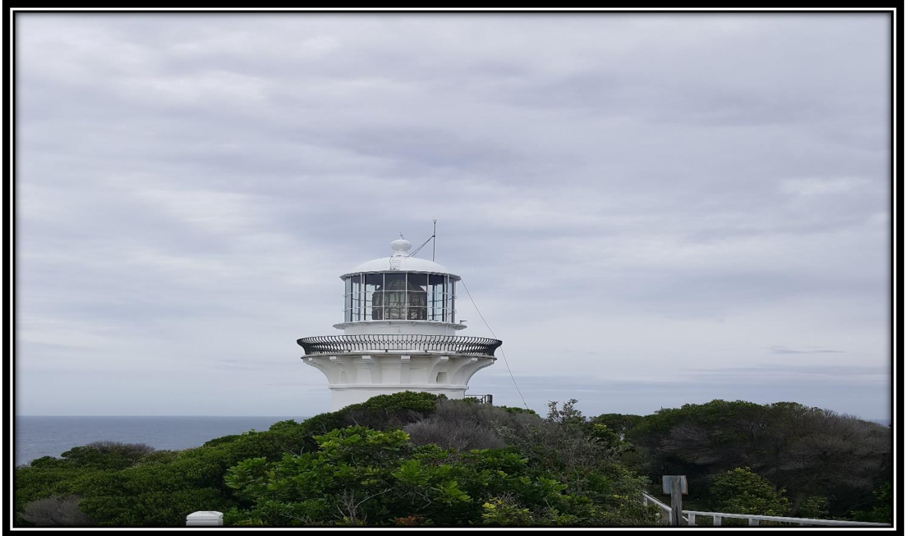
Figure 5 Seal Rocks Lighthouse